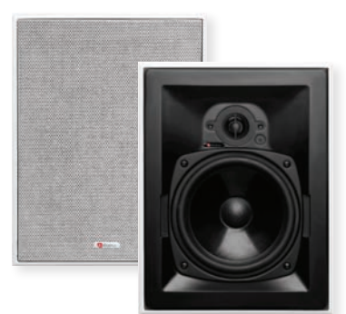
HSi 275 2-Way 6½" In-Wall Speaker